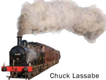
Chuck Lassabe Exalted Ruler